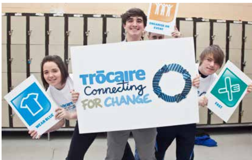
Chef Donal Skehan helps to launch the 2013 'Connecting for Change' campaign.

During the financial year 2013/14, Trócaire received €29.6m in public donations, an increase of 17% from the previous year. This increase is attributable to donations of €7.2m to emergency appeals in 2013.