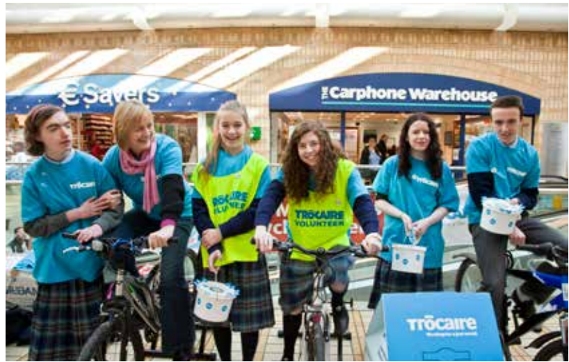
Students from St. Mac Dara's, a school in Dublin that supports Trócaire's work throughout the year.

Our engagement and outreach work saw Trócaire campaign on several key issues throughout 2013. The Lent campaign in 2013 focused on our work in India, where we work with communities in the poorest state, Odisha, to educate them about their rights and empower them to make positive changes to their lives.