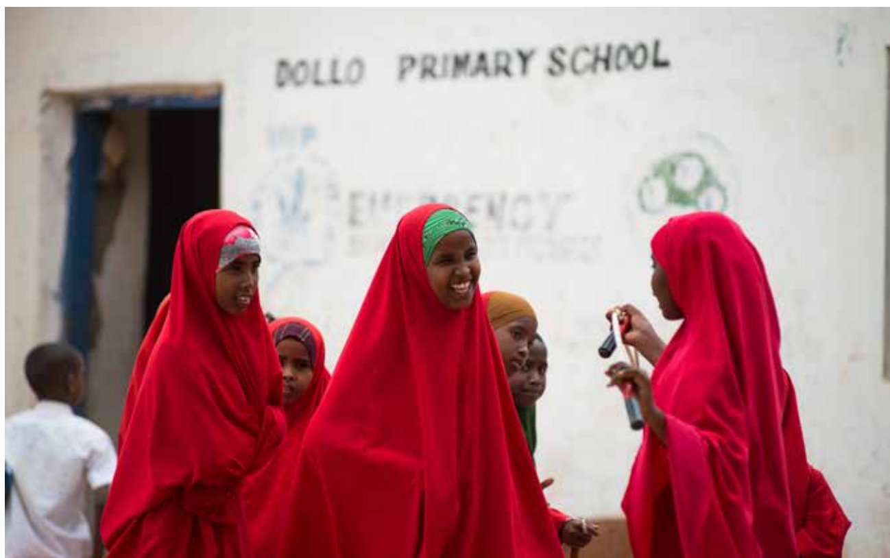
Girls play with skipping ropes during their break time at the Dollow Primary School in southern Somalia that is supported by Trócaire. The school currently has 373 pupils in total, including 118 girls, and are taught by eight teachers.