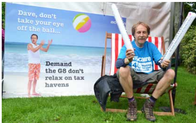
Trócaire campaigners attended the IF rally in Belfast during the G8 summit.

The summer saw a particular focus on the issue of biofuels. An EU target to source 10% of all transport fuel from biofuels by 2020 is leading to land grabs and hunger in the developing world.