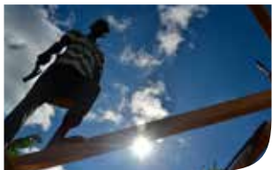
Photo: Trócaire has rebuilt 1,500 and repaired a further 1,500 homes in Haiti.

Long after the cameras have gone we stay and support people to 'build back better' so that they are less vulnerable to future emergencies.