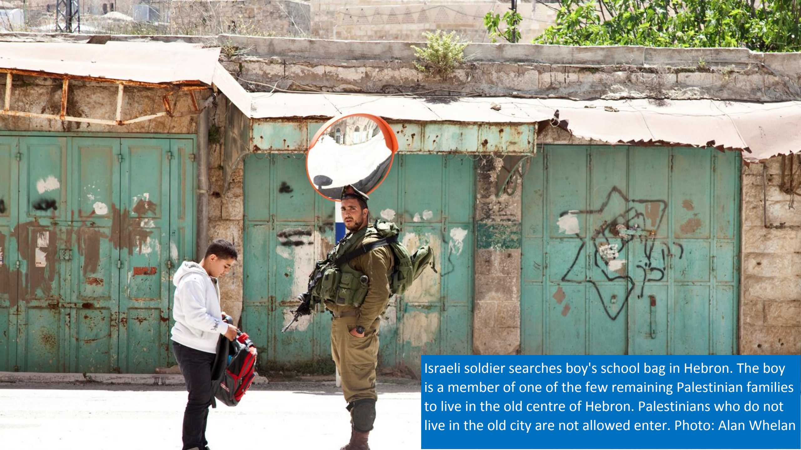
Israeli soldier searches boy's school bag in Hebron. The boy is a member of one of the few remaining Palestinian families to live in the old centre of Hebron. Palestinians who do not live in the old city are not allowed enter.