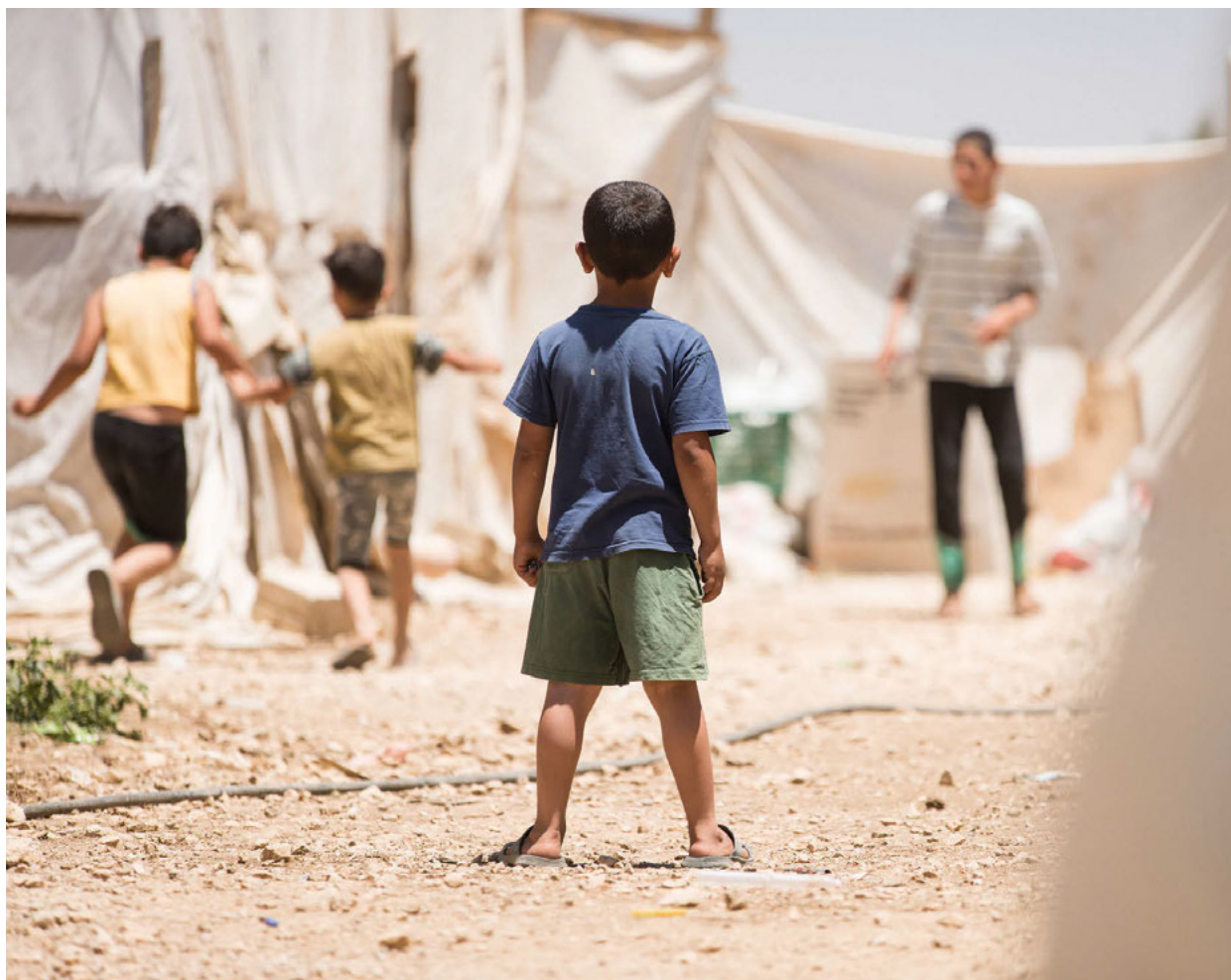
Children playing in a refugee camp in the Beqaa valley in Lebanon.