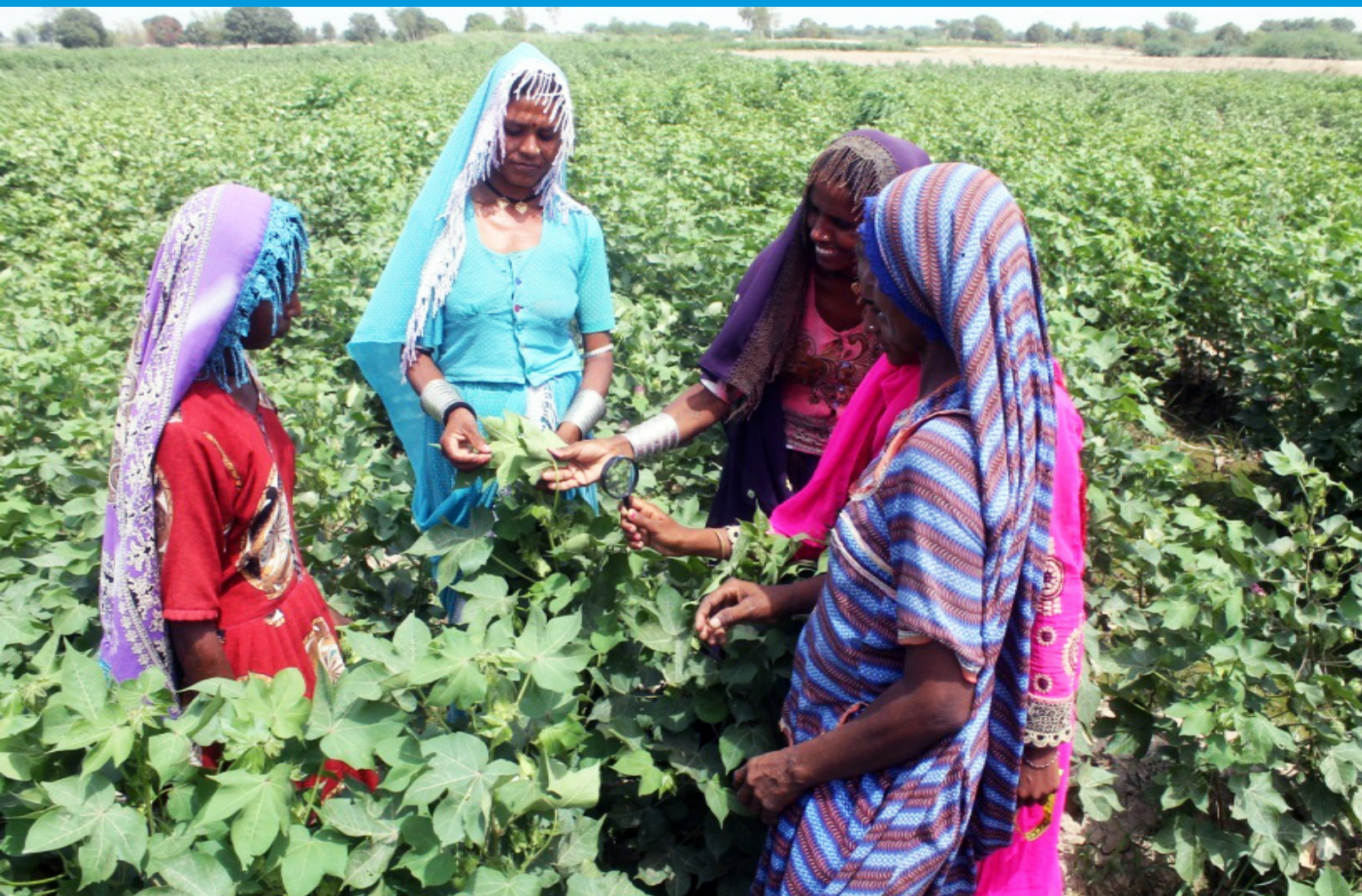
Women Farmers in Mirpur Khas district.