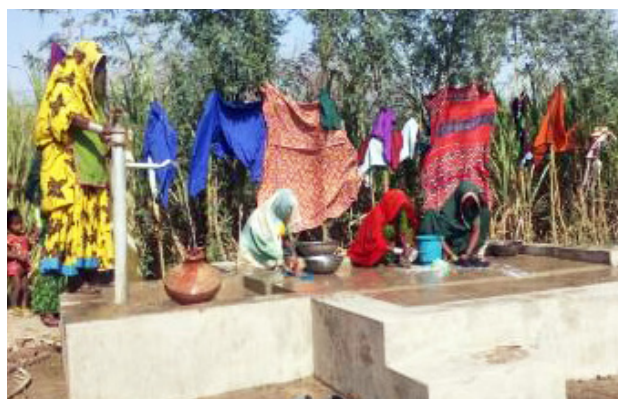
Washing platforms created as part of improving water infrastructure for farmers.

In late 2018, the Government of Pakistan failed to renew the registration of several INGOs, including Trócaire, and ordered the closure of our country office. In compliance with the order, Trócaire closed our