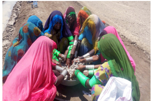
Women farmers in Mirpur Khas district working on a demo plot.

It is recommended that research on women's barriers to accessing and influencing decision-making spaces is undertaken in the pre-design phase of the Citizen Monitoring and Advocacy components of a programme, to ensure strategies are included and resources designated from the outset to address these barriers systematically and progressively. See Trócaire's women's empowerment integration framework for further guidance.