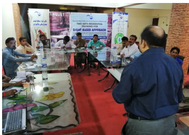
Rights Based Approach training for farmers in Mirpur Khas.

Year-on-year there was a steady increase in knowledge of water rights by the targeted farmers as well as in actions by them to claim water rights. In 2020, there was an increase of almost 25% in rights awareness