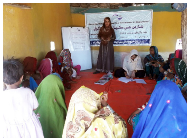
Field Farmer School session for women farmers, Mirpur Khas.

The programme also linked and coordinated farmer organisations with academic and research institutes such as the Sindh Agriculture University which will improve their technical knowledge through using new research and innovative models. Many Farmer